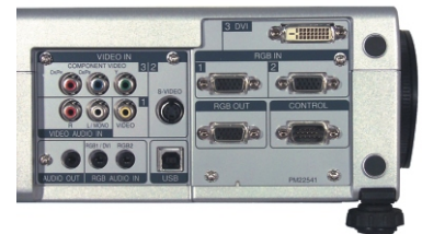
The ImagePro 9115A inputs are easily accessible. Connecting your computer is quick and easy.

The 9115A is HDTV ready. It features 3 RGB (computer) inputs, 3 video inputs, plus RS 232, and mouse control.